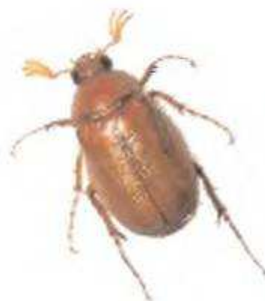
Figure 2. Adult white grubs, often called May or June beetles, are commonly attracted to lights at night.

The most important turfgrass infesting white grubs in Texas are the June beetle, Phyllophaga crinita (Figure 2), and the southern masked chafer, Cyclocephala lurida . Warm season grasses like bermudagrass; zoysiagrass, St. Augustinegrass and buffalograss are attacked readily by both types of white grubs, with most lawn damage occurring during summer and fall months.