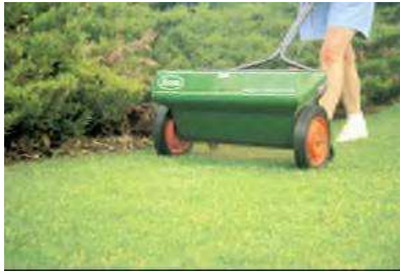
Figure 4. Drop-type spreaders allow precise placement of insecticide granules.

One should be aware that some insecticides could be toxic to birds and other wildlife. Always read and follow label directions, including the precautionary statements pertaining to potential environmental hazards. Apply only the labeled rates, avoid pesticide use near streams and ponds, and irrigate treatments promptly to help reduce the risk to non-target organisms, like birds. Never dispose of leftover pesticides down sewer or storm water drains. Such actions can cause toxicity to fish and other aquatic organisms.