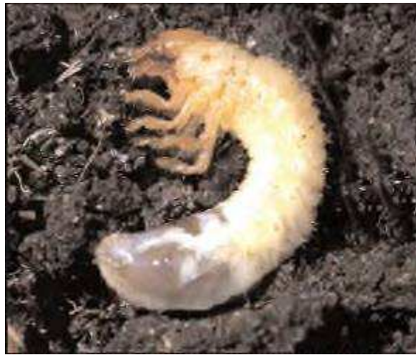
Figure 3. Turfgrass-infesting white grub larvae feeding on grass roots. Grubs are most damaging when they reach a length of 1/2- to 1-inch.

appetites. Feeding by large numbers of third-instar white grubs can quickly destroy turfgrass root systems, preventing efficient uptake of food and water. Damaged turf does not grow vigorously and is extremely susceptible to drying out, especially in hot weather.