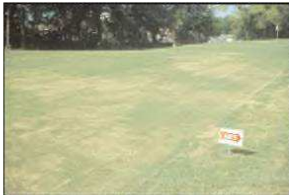
Figure 1. Golf course fairway damaged by white grubs.

White grubs, sometimes referred to as grubworms, injure turf by feeding on roots and other underground plant parts. Damaged areas within lawns lose vigor and turn brown (Figure 1). Severely damaged turf can be lifted by hand or rolled up from the ground like a carpet.